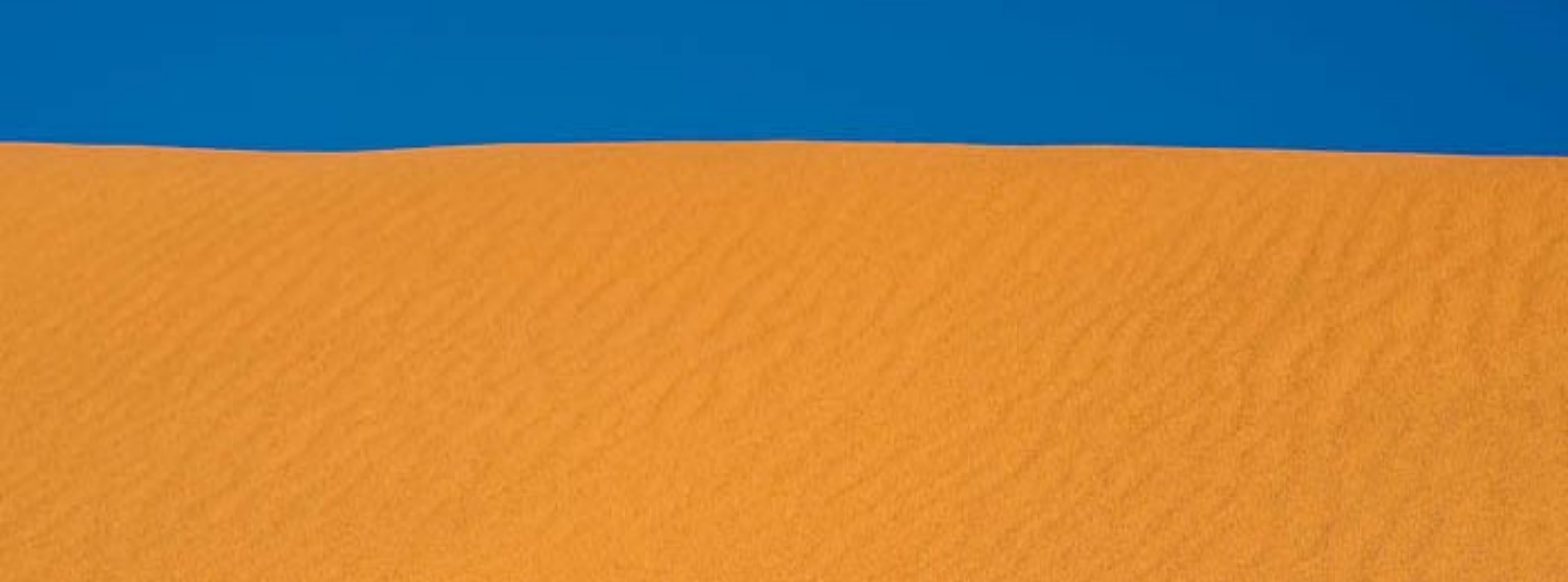
Top: Mesquite Flats Dunes Bottom: Zabriskie Point Right: The Palouse

is usually flooded in the early winter causing the roads to close. “The Racetrack” is a place of stunning beauty and mystery, best known for its strange moving rocks (probably caused by wind!). Although no one has actually seen the rocks move, the long meandering tracks left behind in the mud surface of the playa attest to their activity.