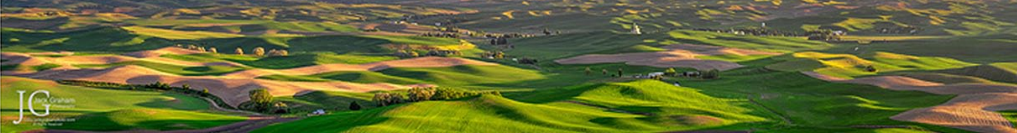
Top & left: The Palouse Bottom: Badwater Playa, Death Valley

For best results, plan on spending at least 4 or 5 days in the area. The best time for photography, like in many other areas, is during the golden hours of sunrise and sunset. The very best light is usually 30 minutes before sunrise and 30-45 minutes after sunset. Keep in mind you will need to be at your location and ready to shoot at least 40 minutes prior to this. You can check the angle of the sun by using the Photographers Ephemeris. During the middle of the day, you could review your images, scout locations for sunrise and sunset photography or wander through some of the small towns like Ridgefield, Garfield and Palouse in search of the often overlooked or neglected photos. Summer days are long ones – be sure to get plenty of rest!