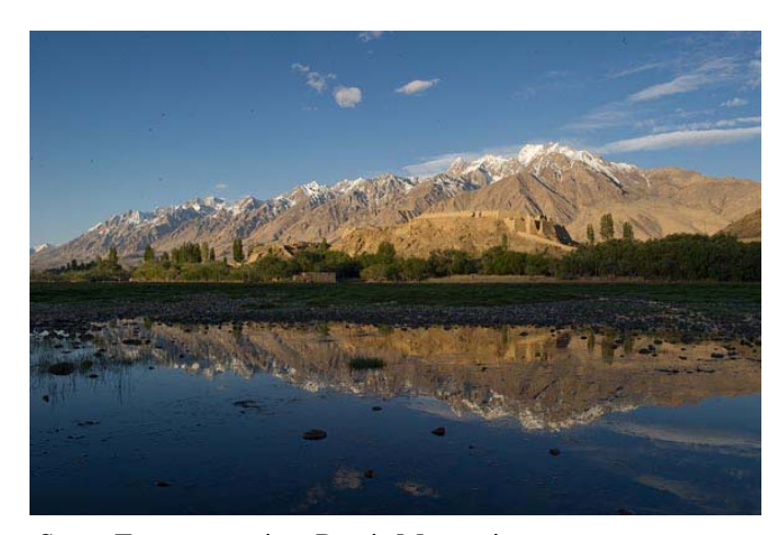
Stone Fortress against Pamir Mountains