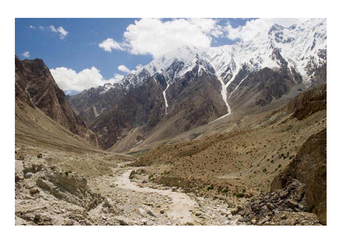
Along the Karakorum Highway