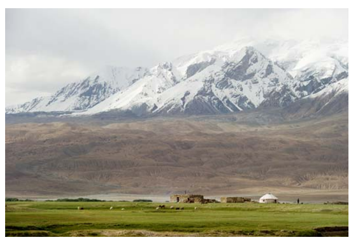
Tajik homes against Pamir Mountains