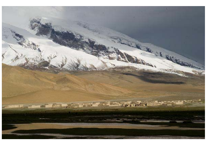
Kyrgyz village and Muztagh Ata Mt. (father of 5 glaciers)