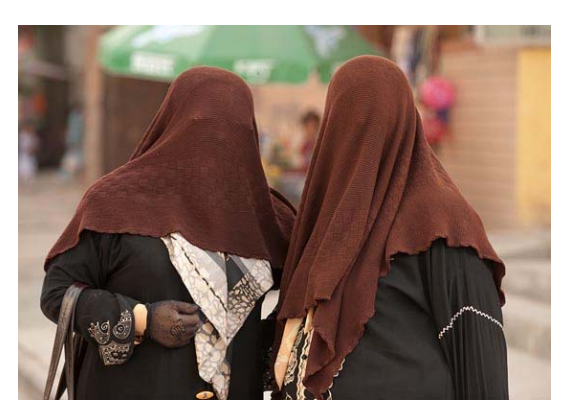
Two Uyghur women