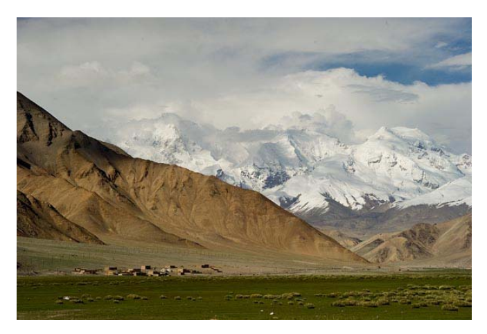
Kyrgyz village & Pamir Mountains