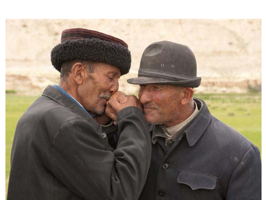
Tajik men greeting each other (eagle greeting)