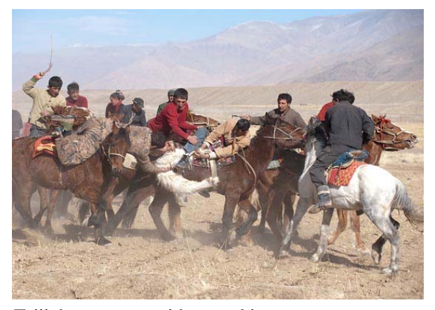
Tajik horse game with goat skin