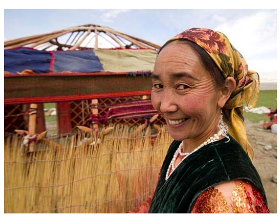
Kyrgyz woman and yurt