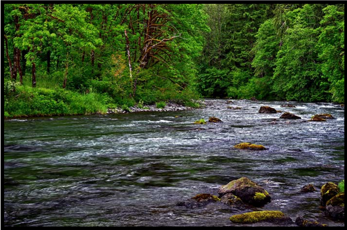
Sol Duc River