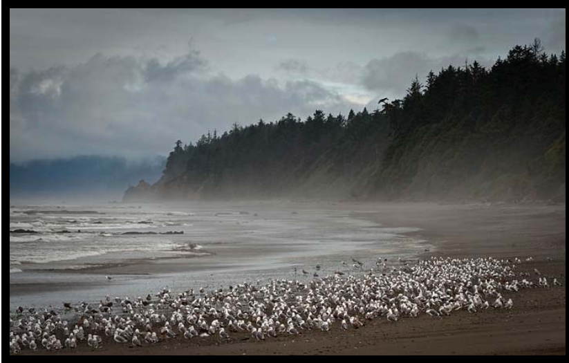
4 th Beach

The workshop will end on Sunday about Noon. If you may want to extend your trip, please let me know and I can direct you in lots of ways! It's about a 5-6 hour drive back to Sea-Tac from Port Angeles. For those thinking about flying out Sunday night . I would highly recommend staying by the airport and flying out Monday AM.