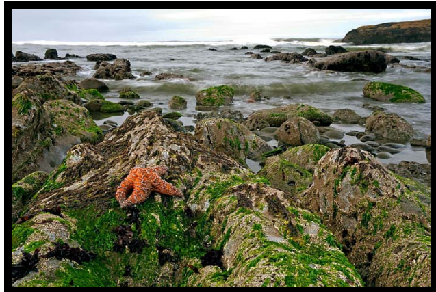
Near Kalaloch, Olympic Coast, Wa

We will explore the areas from Kalaloch to the south to Rialto Beach, First Beach to Second Beach to the north.