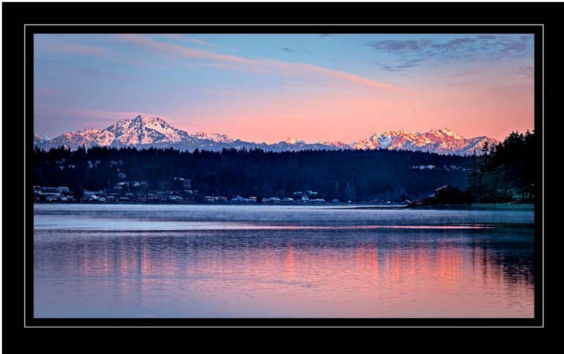
The Olympics', as see from Hood Canal, looking west