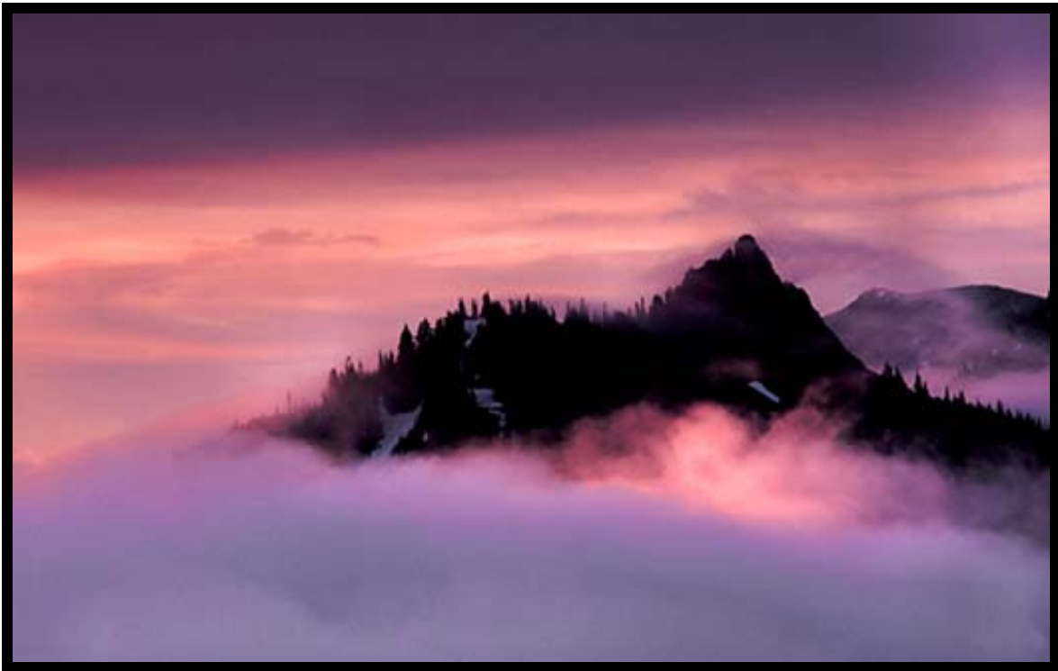
Hurricane Ridge Sunrise